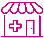
Site of Care Team