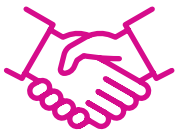
Patient Access Liaisons